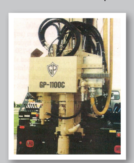
Dual spindle head